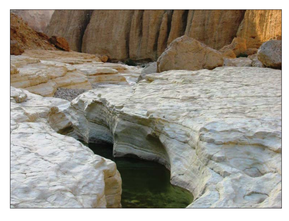
A headspring in the Judean Desert