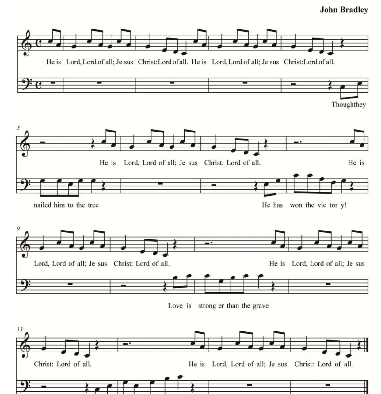
'He is Lord of all'