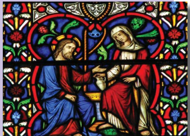
Jesus and the Samaritan woman

A Christian charity discovered a village in Africa where a group of women had to walk twenty miles to fetch water. This took up a large part of the day and the women had to carry heavy vessels of water for long periods in the heat. The charity undertook to dig a well in the village so that the people could have water whenever they wanted. After a while however, the helpers were disturbed to find that the well was being spoiled. The water deliberately being made undrinkable and the women still had to go on their long journey to fetch water. Eventually it turned out that the women themselves were spoiling the well. The journey to fetch water was actually important to them, giving them time to themselves, time to have important conversations about the men of the village and bonding them together. The helpers just assumed that the well was the best thing to make everyone's life easier and believed the women had said they wanted the well, but no one actually listened to what they had to say.