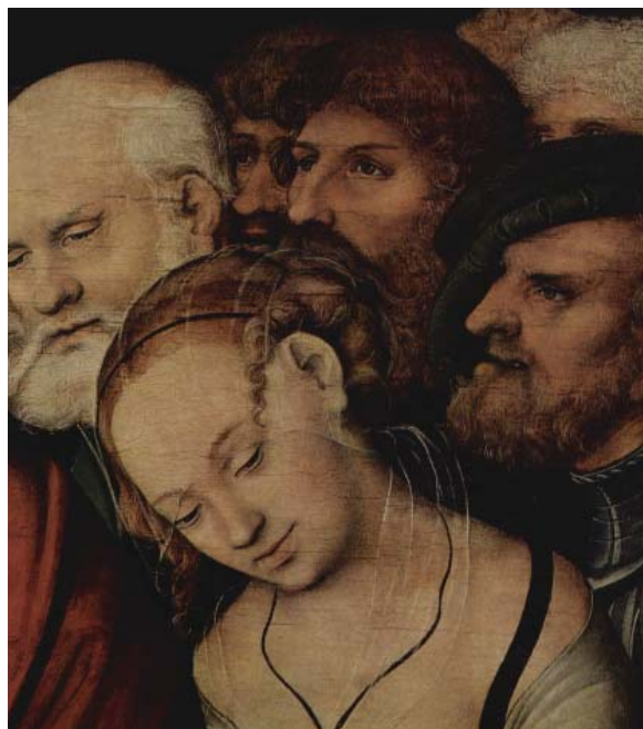
Christ and the Adulteress by Lucas Cranach

(part of a collection of reproductions compiled by The Yorck Project)