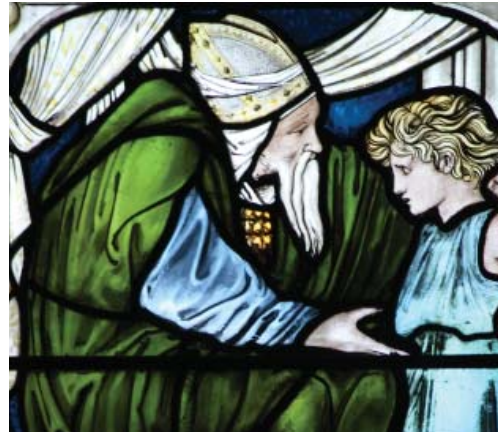
Eli and Samuel (1 Samuel 3.1-10)