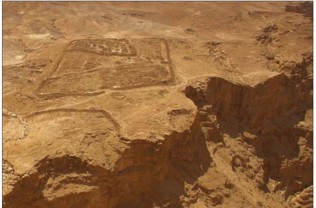
A Roman camp near Masada, Judean Desert, Israel

We may imagine that Jesus sought out this region in order to let the environment and its people shape his thoughts as he meditated on God's will. It was a place where he could more easily focus his attention completely on God without distraction or interruption. What he saw recalled his mind to his purpose - how to serve God completely and to do God's