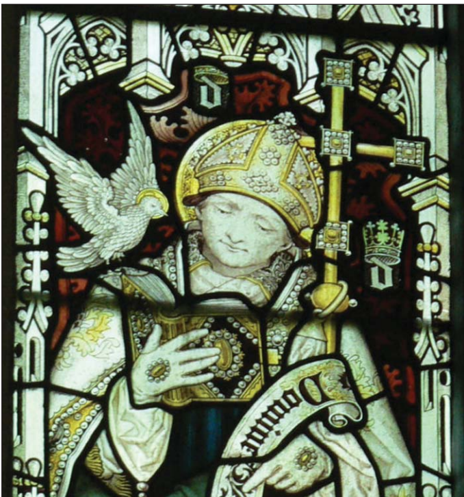
A stained glass window in Jesus College Chapel, Oxford, showing St David and the dove.