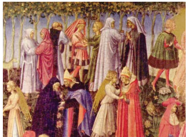
Paradies by Giovanni di Paolo (part of a collection of reproductions compiled by The Yorck Project)