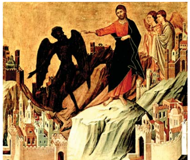
Temptation of Christ by Duccio di Buoninsegna (part of a collection of reproductions compiled by The Yorck Project)