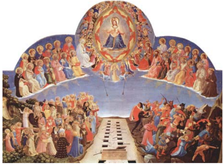
The Last Judgement by Fra Angelico (part of a collection of reproductions compiled by The Yorck Project)

What kinds of images are conjured up by 'heaven' and 'hell'? The images we think of when