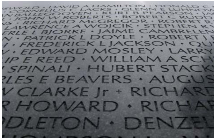
Vietnam Veterans Memorial, Washington