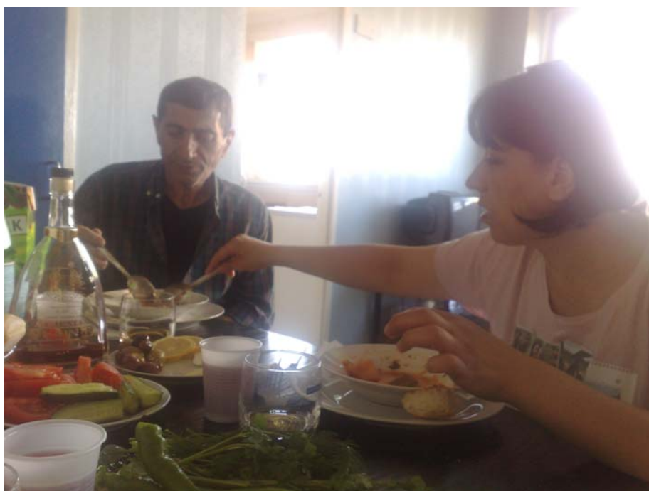
Celebrating hope amidst friends, with cabbage stew, salad and fine brandy from back home.