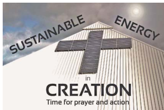
Photo: solar panels on Caloundra Uniting Church, Queensland, Australia