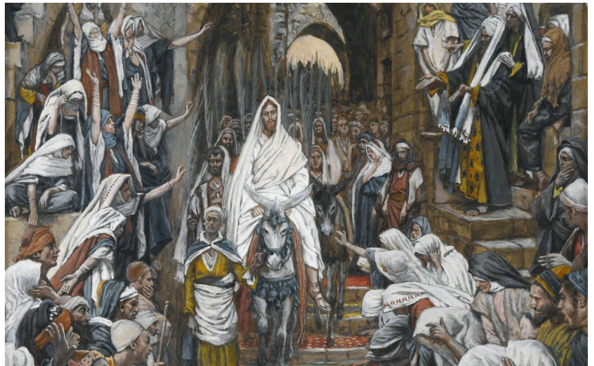
The Procession in the Streets of Jerusalem, James Tissot, Brooklyn Museum

Topic for local radio: A personal story of coming close to death and a second chance